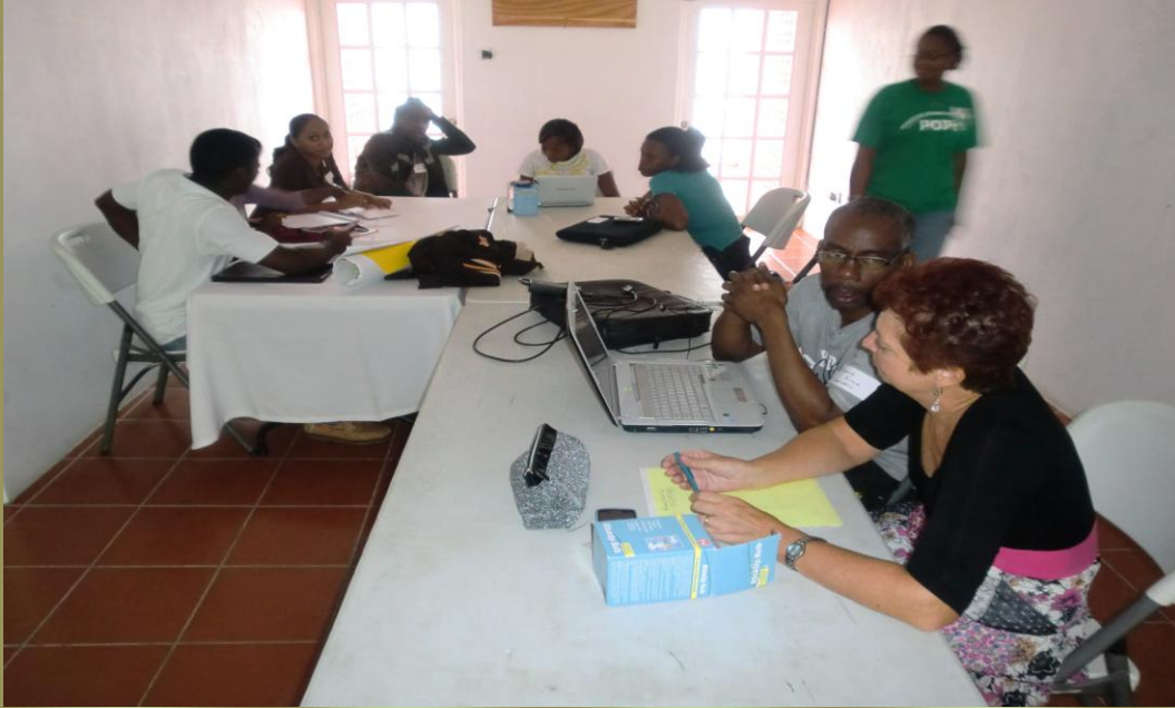
CYEN members engaging in discourse