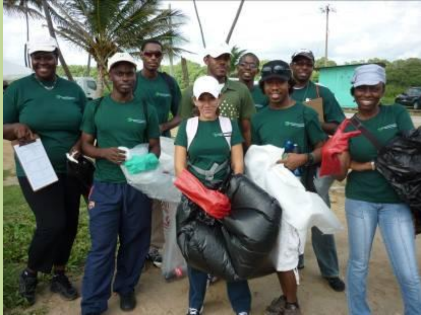
CYENTT members getting all geared up to take the beach by storm