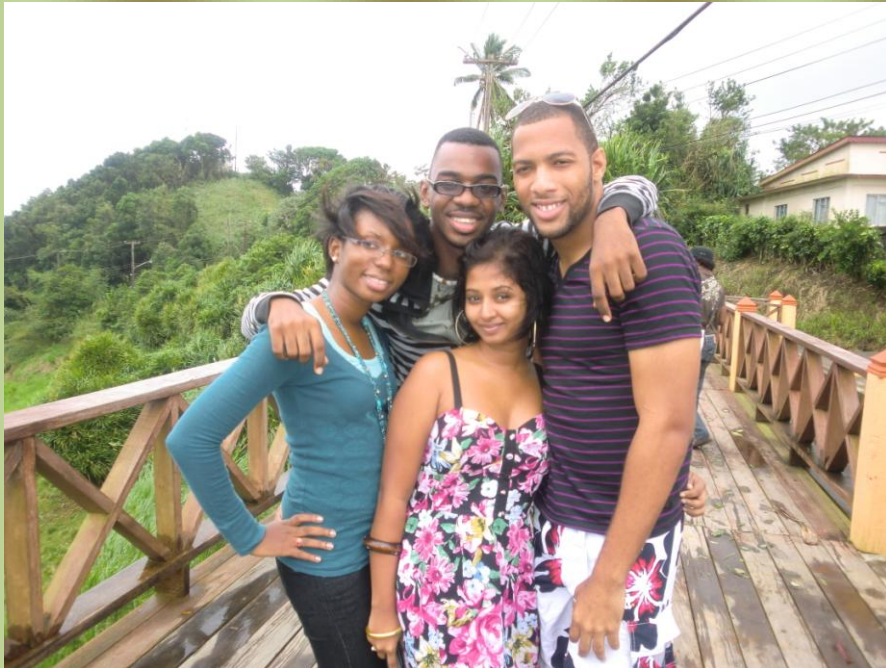
Members taken time to marvel at a tourist attraction