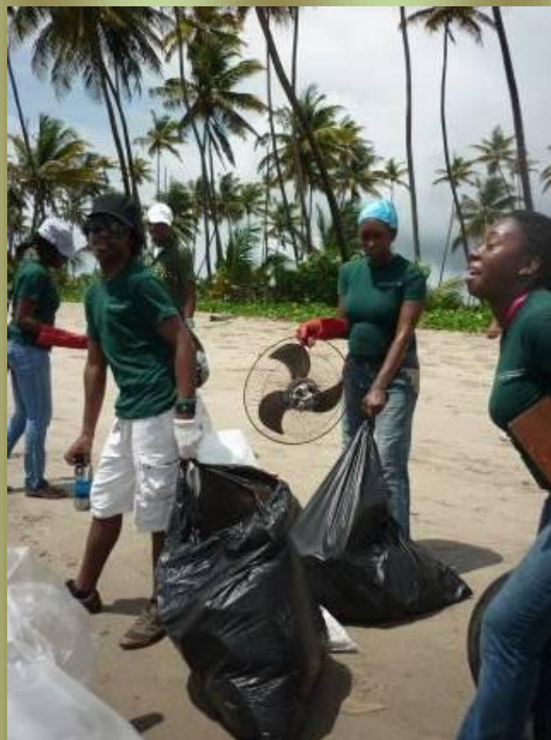
Members logging back garbage to Cleanup base.