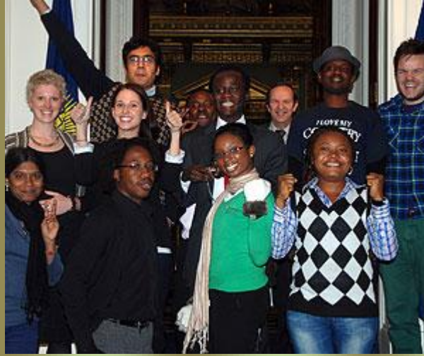
Participants in the Commonwealth Youth Symposium